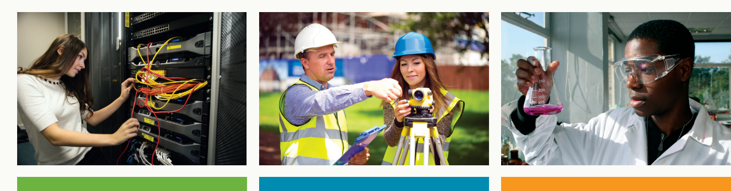
82 percent of Advanced Career students see a connection between what they do in their AC classes and potential future studies and a career.